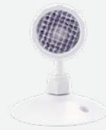
10195 / 10029